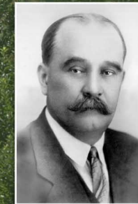
Peter P. Verigin